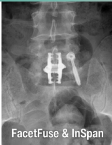
FacetFuse & InSpan