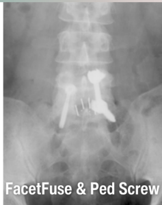
FacetFuse & Ped Screw